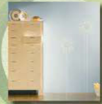
◀ sun spray

to see the entire range of available stencil finishes, visit our website www.asianpaints.com