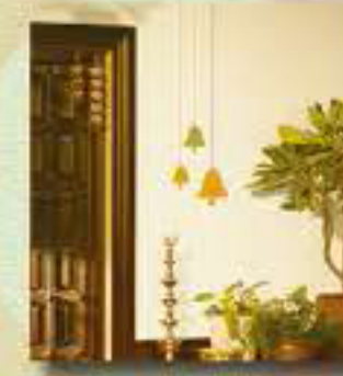
morning raga ▶