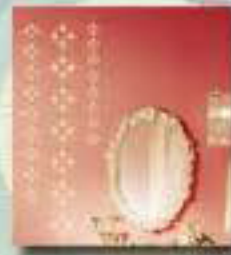
◀ gypsy beads