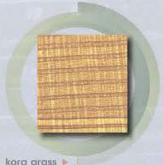
kora grass ▶