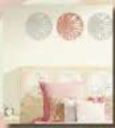
flower power ▶