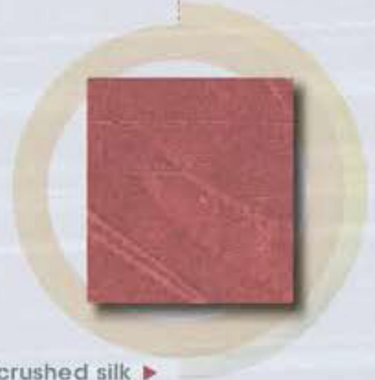
crushed silk ▶