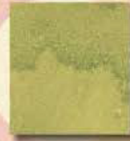
colour wash ▶