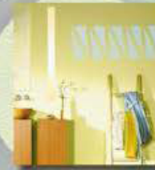
paper planes ▶