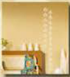
french riviera ▶