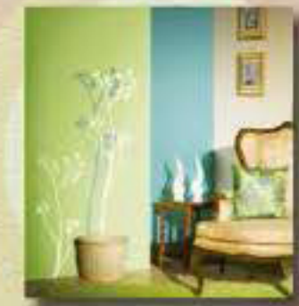
◀ summer bloom